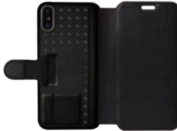
For iPhone X