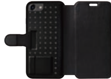
For iPhone 6/7/8