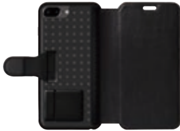
For iP 7Plus/8Plus